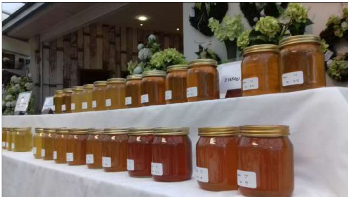
Jars of honey are ready to be judged at the Inverness-Shire Beekeeping Association Honey Show!